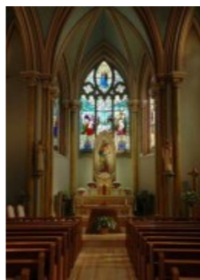
The Shrine of Our Lady of the Sacred Heart Quebec, Canada.