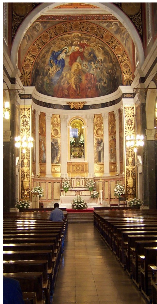
The Shrine of Our Lady of the Sacred Heart, Barcelona, Spain

Also we have a special feature on the process of Beatification for seven young MSC martyrs of Canet de Mar near Barcelona, Spain, 1936.