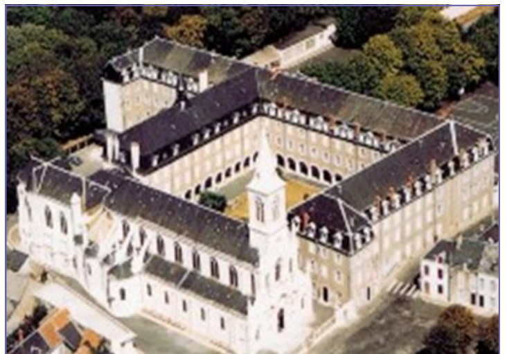
Monastery, Basilica and Shrine, Issoudun