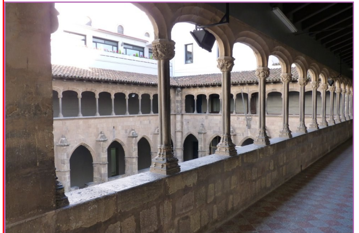
Ancient Cloister of a Monastery around which MSC built the modern Colegio San Miguel.

The new format of the Novena, can be found on the web: www.sacredheart.org.au You can post petitions to Novena, PO Box 309, Randwick, NSW 2031, Or email to: prayersplease@olshaustralia.org.au The Novena is held each Thursday 11.30-midday in the Shrine.