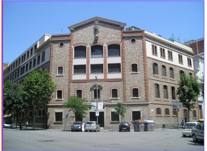
Collegio San Miguel, (MSC) Barcelona, Spain.

Finally, for now, it is clear, that like in any committed relationship, such as marriage, at the core of every spirituality is the capacity for renunciation and a capacity for union with others. As Christ said: "If anyone wants to be a follower of mine, let them renounce themselves and take up their cross" which constitutes the "negative side" of discipleship, and then "follow me", which constitutes 'union', the positive side of discipleship. The positive elements in Fr Chevalier's spirituality can be very attractive, just as they can be very demanding: "Obedience in mutual charity" .