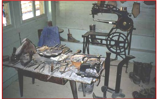
The shoe-maker's shop, Richelieu, in which Jules Chevalier first found work before entering the minor seminary.

During his seminary days in Issoudun he also taught in the Junior Seminary and worked in the Annals Office: