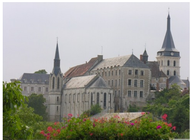
Junior Seminary, St Gauthier, France