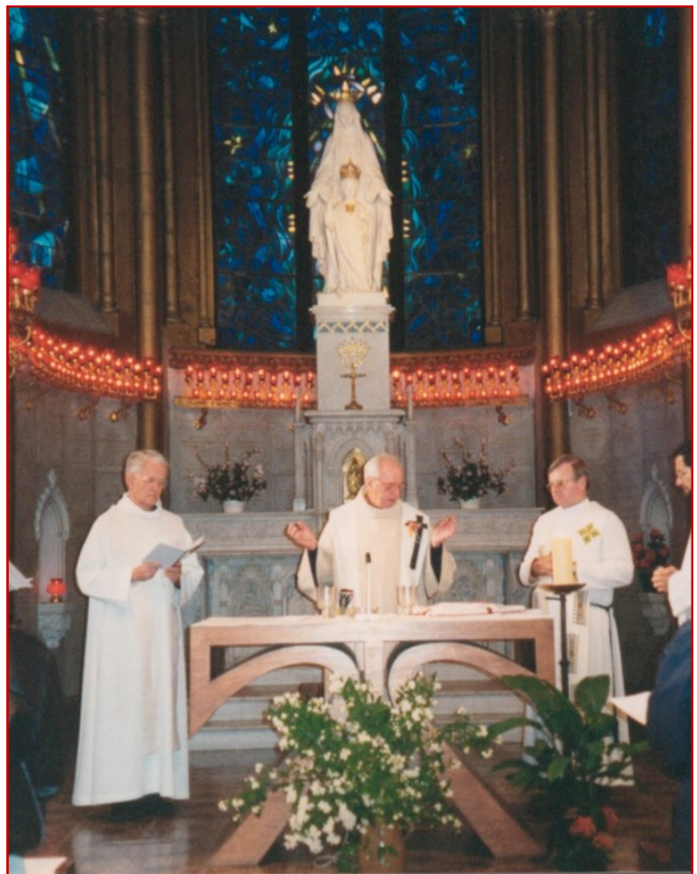
The Shrine at Issoudun—a place of serenity, consolation and peace.