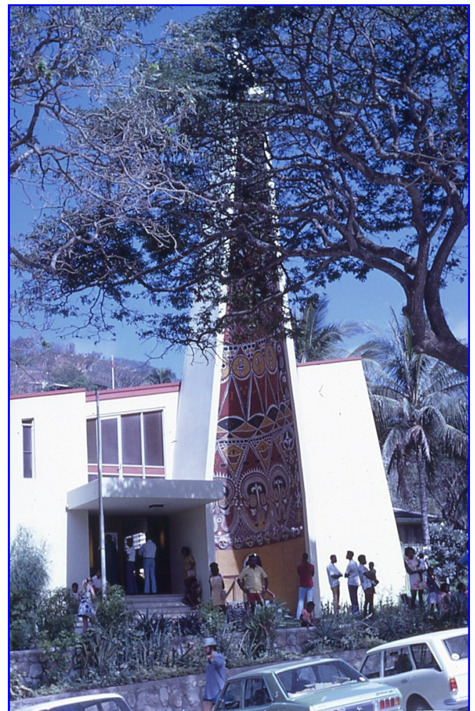
St Mary's, Port Moresby, Cathedral of Cardinal Ribat, built in 1968. It features a beautiful tower adorned with indigenous art from the Sepik district.